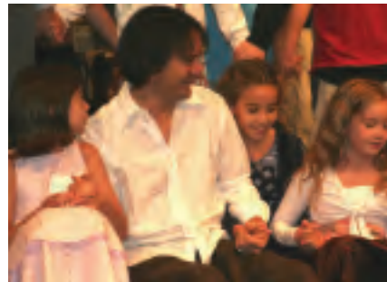
Peace Song and Laughter