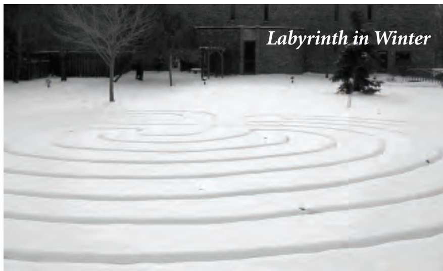
You might have thought the labyrinth on our north yard was gone, but you can see it peeking out of the snow. Rocks that once formed the labyrinth were replaced with inlaid brick a few years ago to reduce the lawn mowing and maintenance.

The most famous meditation labyrinth is the Chartres Cathedral labyrinth in France. There is a prayer labyrinth at Unity Village (drawn on the parking lot north of the new Spiritual