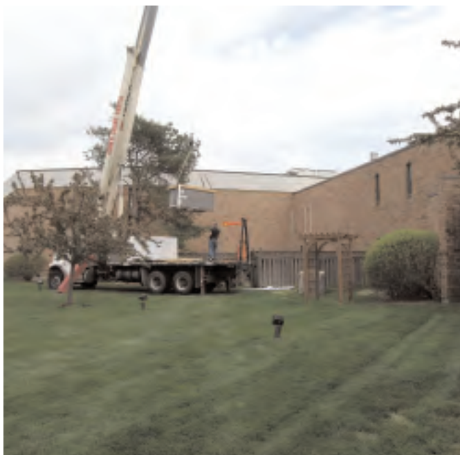
Crane lifting old HVAC units to replace with new ones.

As we look at new landscape plans for the church, notice what is being done by one of the Action Planning sub-teams, the "Dirt Angels," as they weed, trim, and clean-up around the facility.